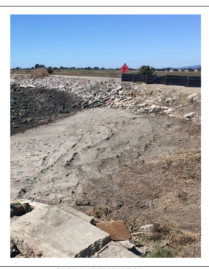
ORIGINAL LEVEE CONDITION